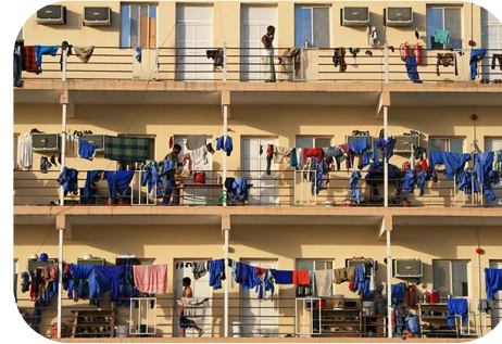
Poor working & living conditions