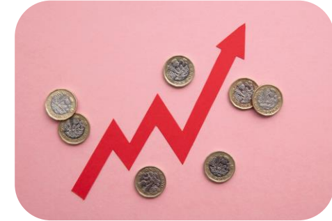
Poverty wages & unpaid work