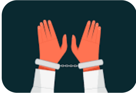
Forced labour & modern slavery