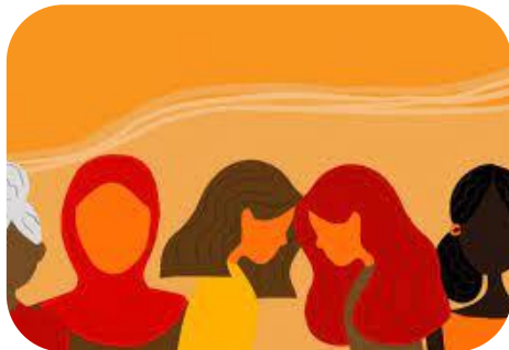
Gender based violence