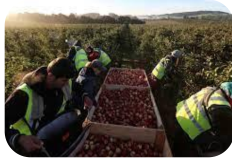
Illegal recruitment & debt bondage