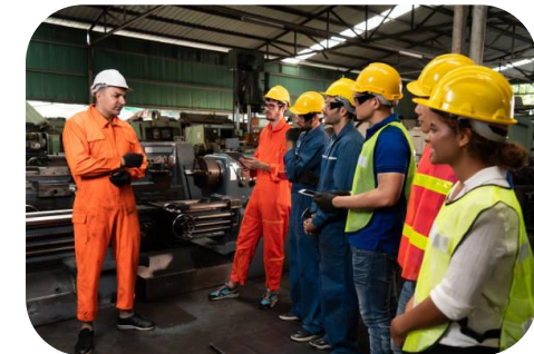
Lack of grievance mechanisms