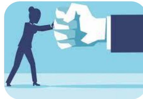
Harsh & inhumane treatment